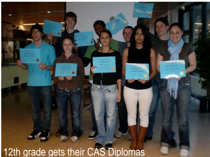
12th grade gets their CAS Diplomas