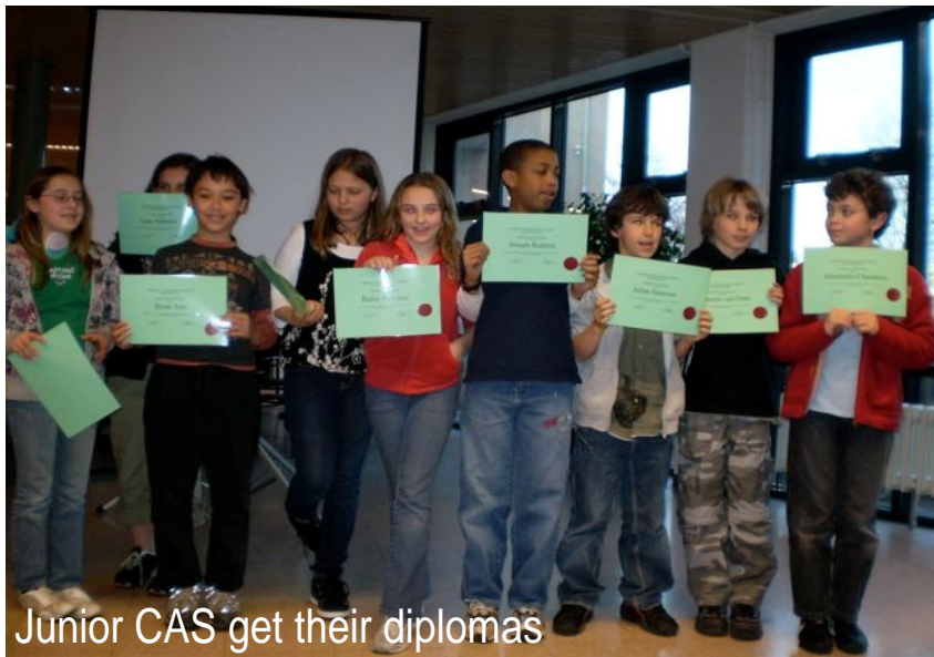
Junior CAS get their diplomas

All of this work in upper elementary school and middle school just goes to show that by the time it comes to being in high school helping others is just second nature to students of AISR! The