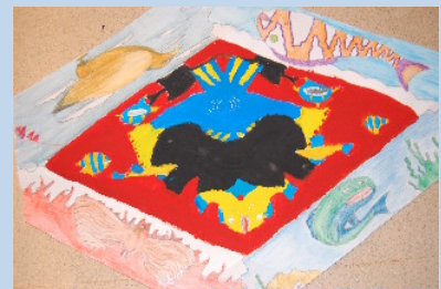
Artist of the Month