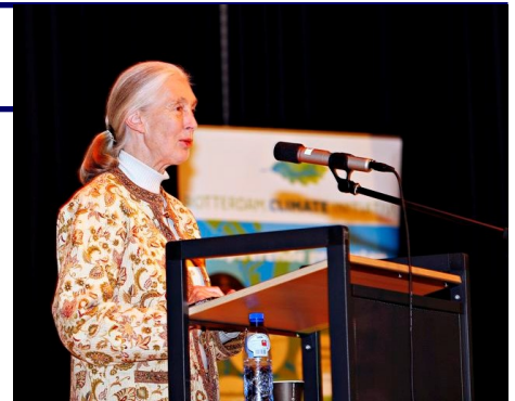
Roots & Shoots project next year.

( http://www.rootsandshoots.org/aboutus/mission ). AISR’s students designed a Roots & Shoots project, the “Eco-Challenge Month”. The students provided us with a detailed presentation highlighting their planning process and the implementation of the “Eco-